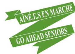
Go Ahead Seniors